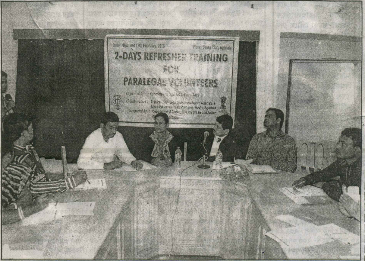
সোমবার আগরতলায় আইন বিষয়ক কর্মশালা আয়োজিত হয়।

17 February 2015 ■ আগরতলা, ১৭ ফেব্রুয়ারী ২০১৫ ইং ■ ৪ ফাল্গুন, ১৪২১ বঙ্গাব্দ, মঙ্গলবার ■ RNI Regn. No. RN 731/57 ■ F