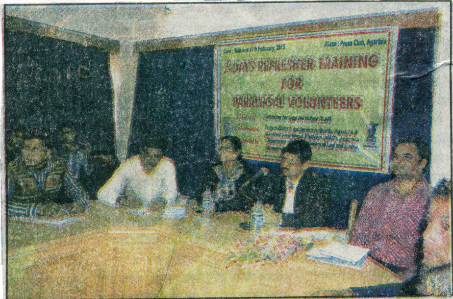
আইন বিষয়ক দুই দিন ব্যাপী কর্মশালা শুরু প্রেস ক্লাবে, উদ্যোক্তা সি এল এ পি

EARS ✿ ISSUE -177 , AGARTALA, 17 FEBRUARY, 2015, TUESDAY ✿ RNI NO. 31003/76 ✿ PHONE & FAX :- 0381-251-5859 email