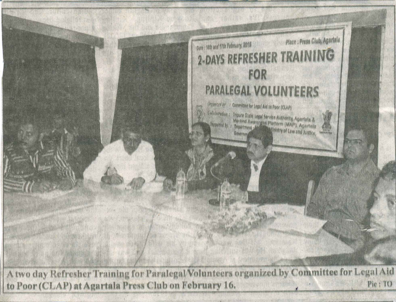
A two day Refresher Training for Paralegal Volunteers organized by Committee for Legal Aid to Poor (CLAP) at Agartala Press Club on February 16.

RNI 53832/93 | AGARTALA | TUESDAY | 17 TH February 2015 | POSTAL REGI. NO. AGT/NE-1027 | PHONE : 232-3508/Mobile-9436127693